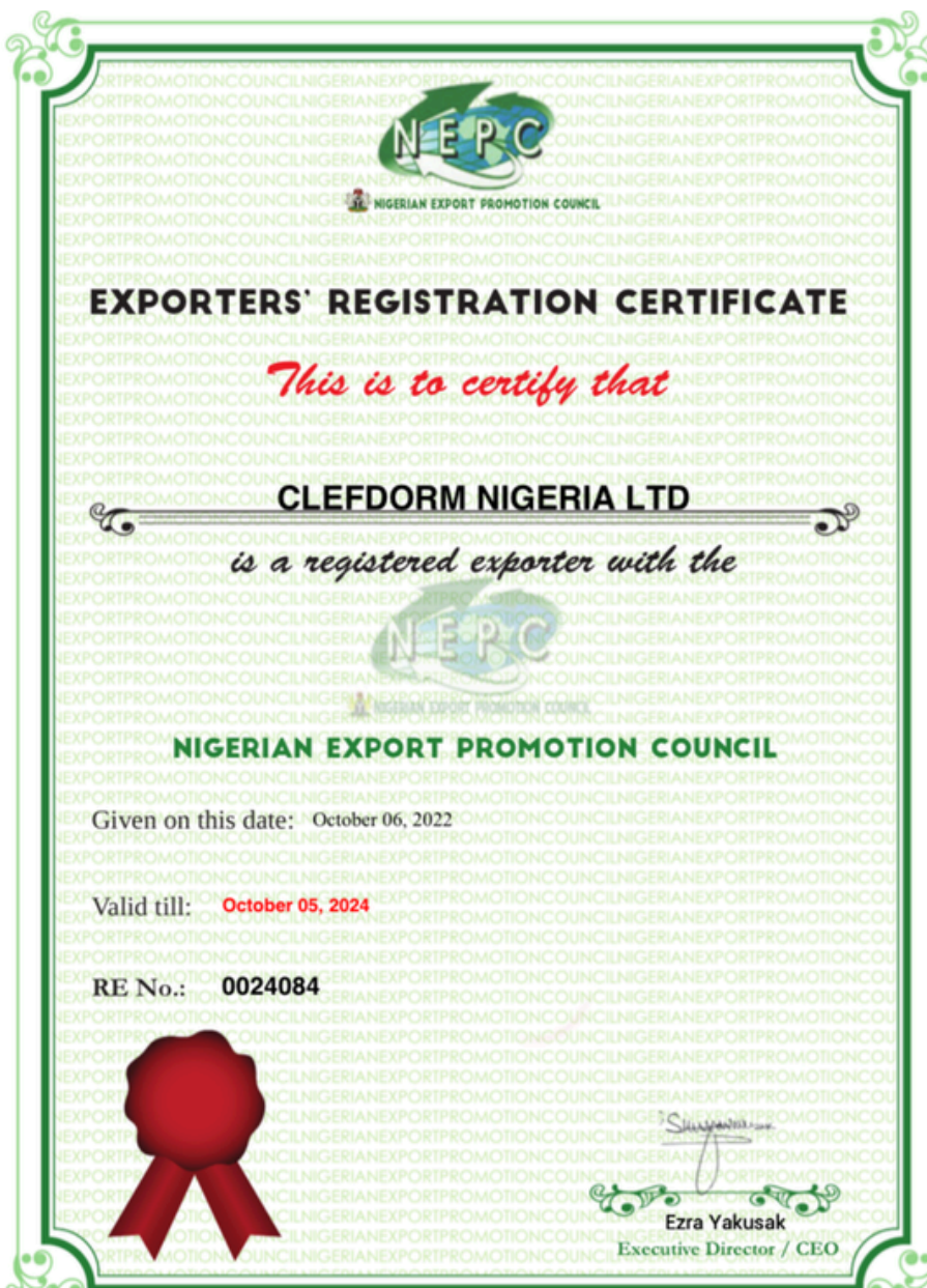
Nigerian Export Promotion Council Certificate (NEPC)