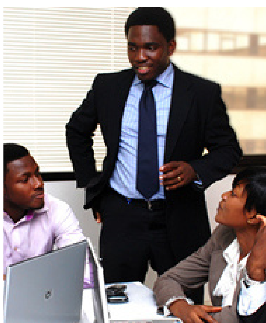
Training & Consultancy