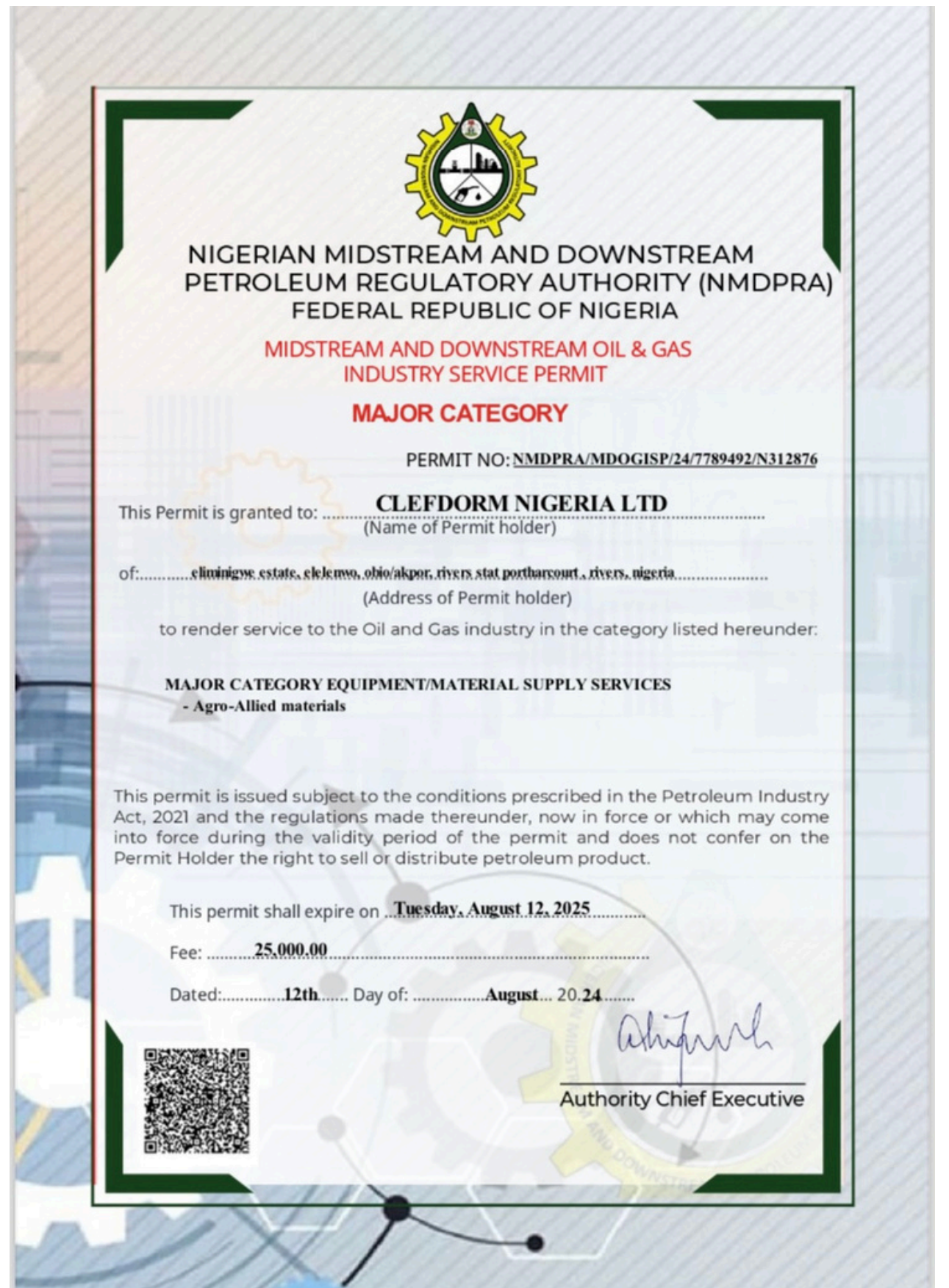
Midstream and Downstream Oil & Gas Industry Permit (Agro-Allied Materials)