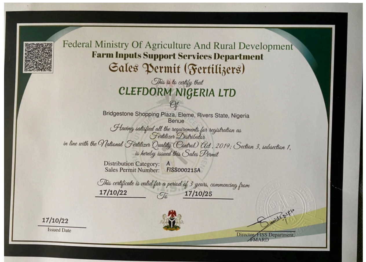
Federal Ministry of Agriculture Fertilizer Sales Permit