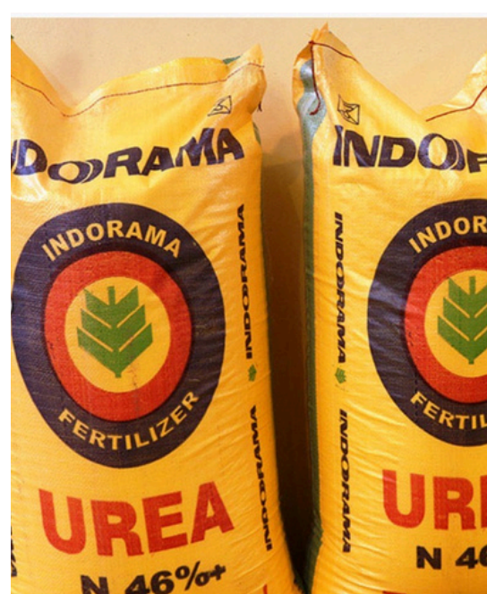
Fertilizer and Polymer Supply