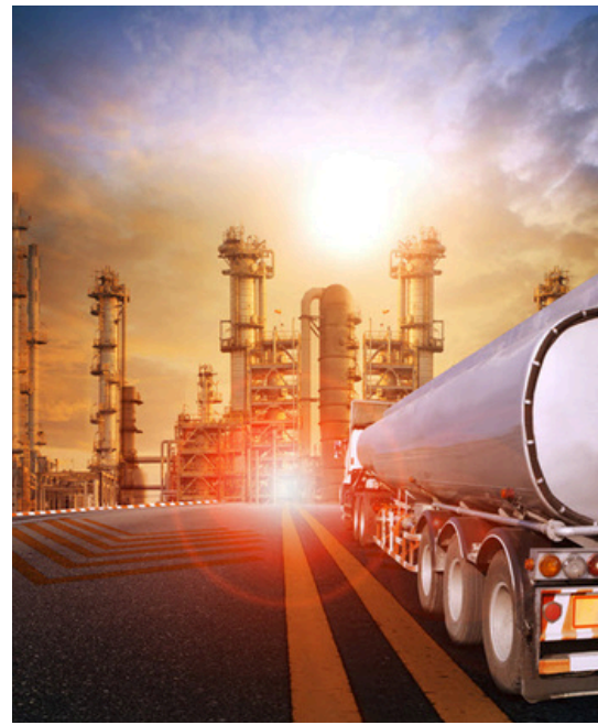
Oil and Gas Supplies