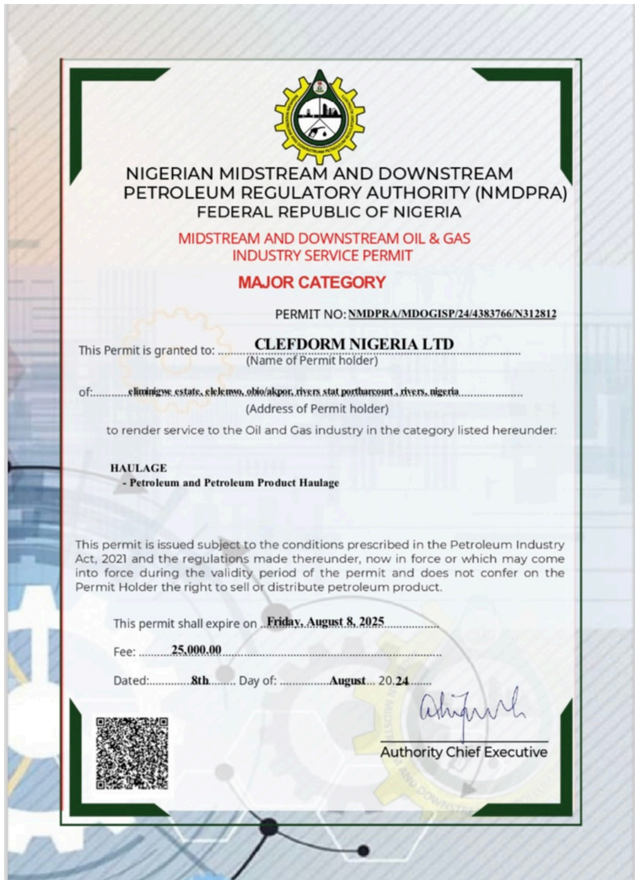
Midstream and Downstream Oil & Gas Industry Permit (Petroleum and Petroleum Product Haulage)