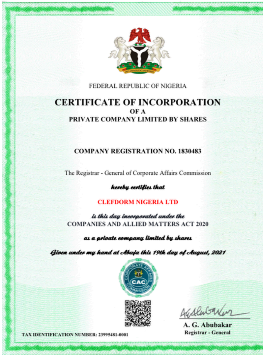
Corporate Affairs Registration Certificate (CAC)